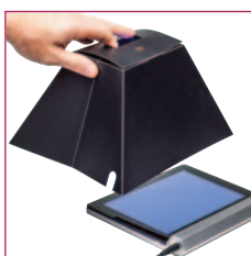
Supplied with a flatpack hood