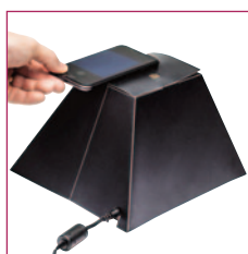
Use your phone to capture an image